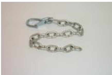
ICE1097-18 CHAIN, STANDARD CHUTE 18 LINKS