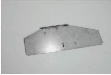
ICE1279SS CHUTE, LEFT HAND BAFFLE, STAINLESS STEEL