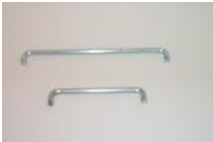
ICE1105 CONTROL ROD 6 5/8"