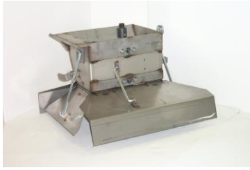
ICE1303SS CHUTE ASSEMBLY STAINLESS STEEL