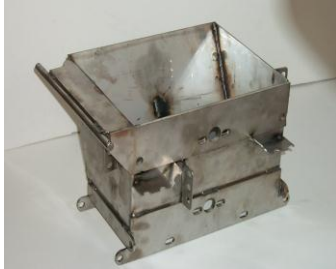
ICE1265SS CHUTE BODY, STAINLESS STEEL