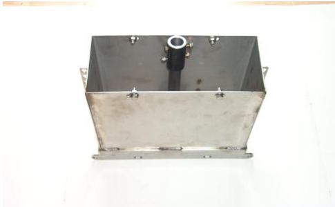
ICE1293SS CHUTE EXTENSION KIT STAINLESS STEEL