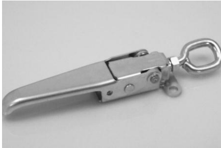
ICE1229 LATCH CHUTE