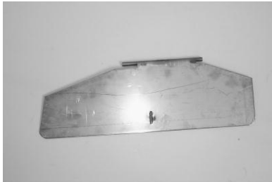
ICE1280SS CHUTE, RIGHT HAND BAFFLE, STAINLESS STEEL