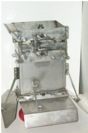
ICE1344SS LONG CHUTE ASSEMBLY STAINLESS STEEL