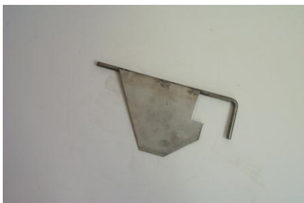
ICE1281SS-L CHUTE, LEFT HAND INNER DEFLECTOR, STAINLESS STEEL