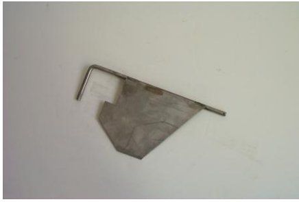
ICE1281SS-R CHUTE, RIGHT HAND DEFLECTOR, STAINLESS STEEL