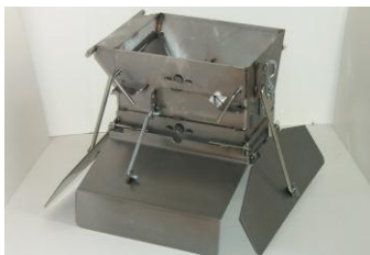
ICE1341SS CHUTE BODY/W BAFFLES & DEFLECTORS STAINLESS STEEL